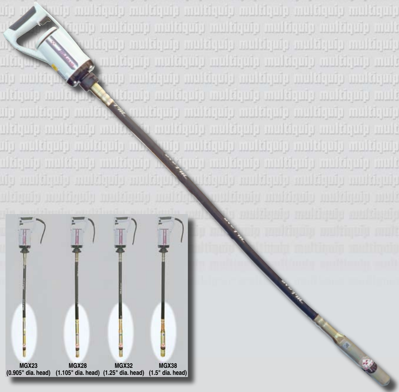
MGX23 (0.905" dia. head) MGX28 (1.105" dia. head) MGX32 (1.25" dia. head) MGX38 (1.5" dia. head)

A full series of lightweight handheld vibrators with exceptional power